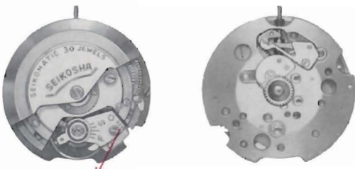
Cal. 603 30j