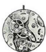
cal. 675 S seconde au centre