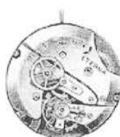
cal. 965 S seconde au centre cal. 970 S seconde au centre cal. 1020 S seconde au centre